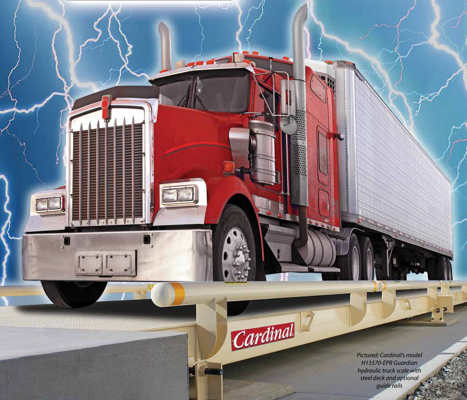
Pictured: Cardinal's model H13570-EPR Guardian hydraulic truck scale with steel deck and optional guide rails

Lifetime Load Cell Warranty • Impervious Against Lightning and Water Damage