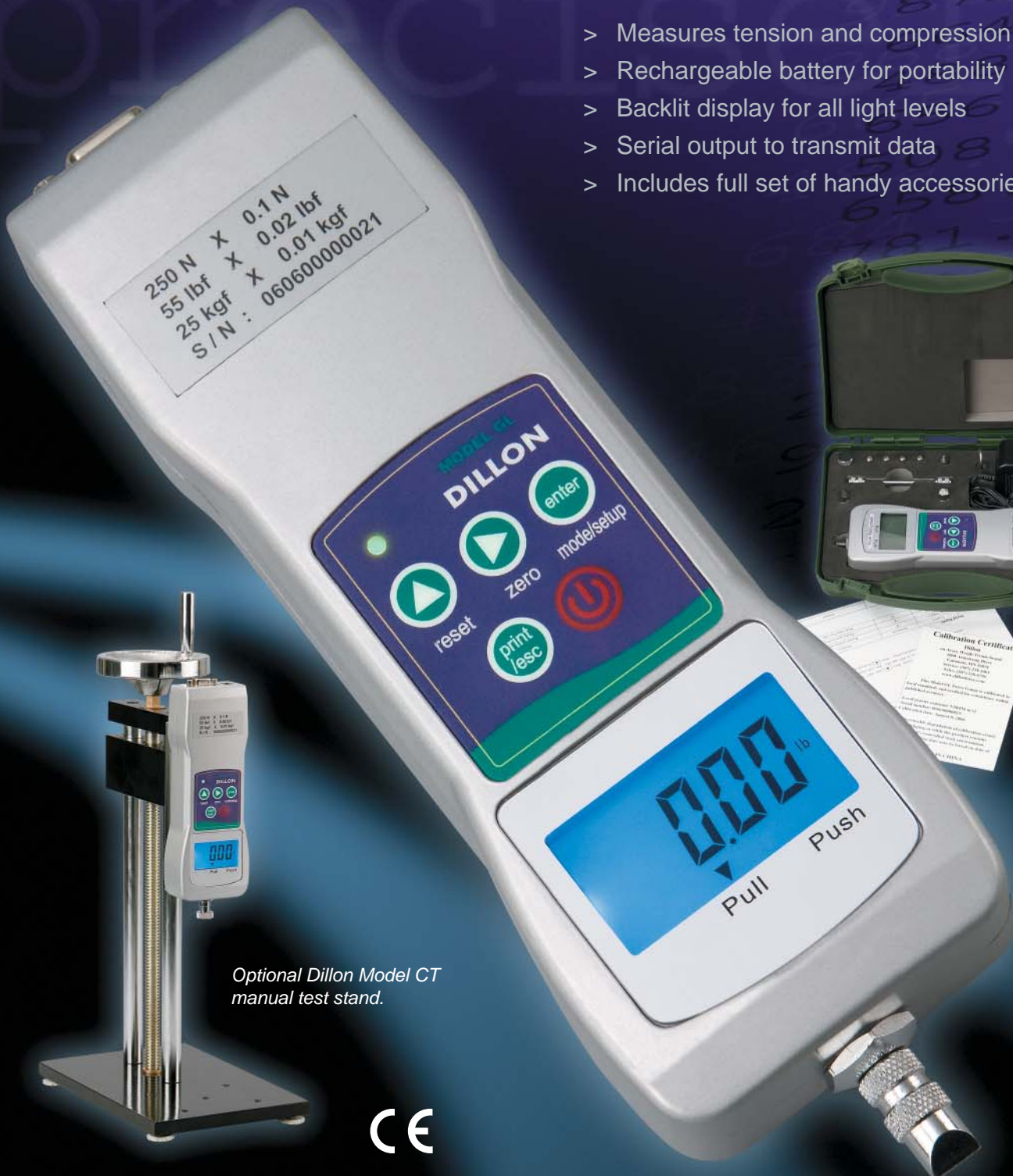
Optional Dillon Model CT manual test stand.